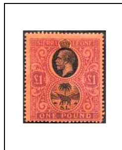
1 £ 105