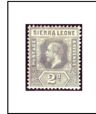
2 p 92