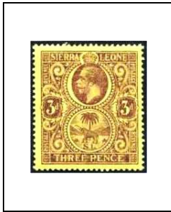
3 p 100