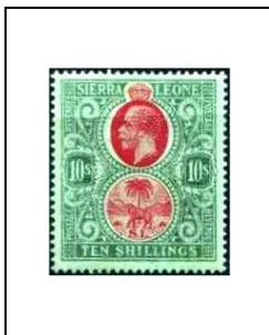
10 s 104