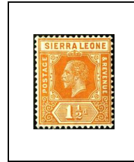
1 1/2 p 91