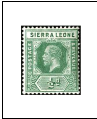
1/2 p 89