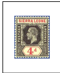
4 p 94