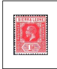
1 p 90