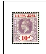
10 p 99