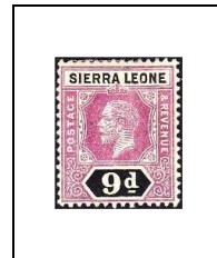
9 p 98