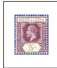
5 p 95