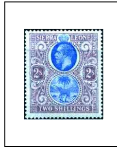
2 s 102