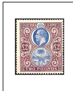
2 £ 106