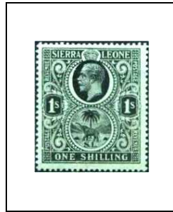
1 s 101