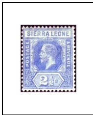
2 1/2 p 93