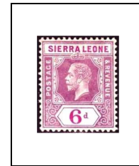
6 p 96