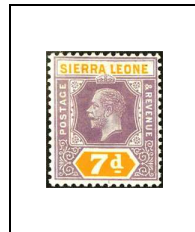
7 p 97